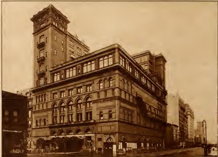
CARNEGIE HALL, home of the Philharmonic Orchestra